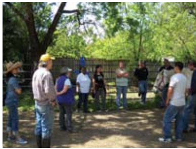
Crestwood Pleasant Hill staff learning skill-building exercises at Over the Rainbow therapeutic horse riding facility.