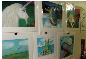
Artwork showcased at the Expressions of the Soul auction Bridge House, Eureka (3/25/09)

Ninety pieces of art were sold by silent auction, with some artists earning more than $300 for their collection of pieces. The event was a triumph in every way, and Bridge House is receiving warm praise from community members on the wonderful show. ◀