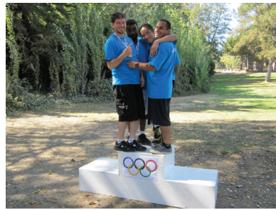
The Crestwood Solano relay team celebrating at the Crestwood Olympics.

The Crestwood Olympics has become an annual event that is not to be missed. Hosted by Crestwood Solano, this past September marked the 4th year that this exciting event was held at Dan Foley Park in Vallejo. Participants from Crestwood Center Sacramento, Crestwood Center at Napa Valley, Crestwood Manor Vallejo and Crestwood Solano came together to compete in this year's event.