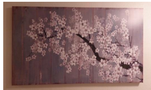
Painting in hallway