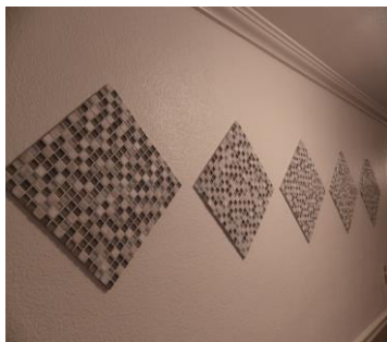
Tiles in hallway

We have a few more changes coming soon and we are excited about the changes that have already taken place and changes that are soon to come.