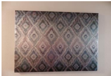
Painting in hallway